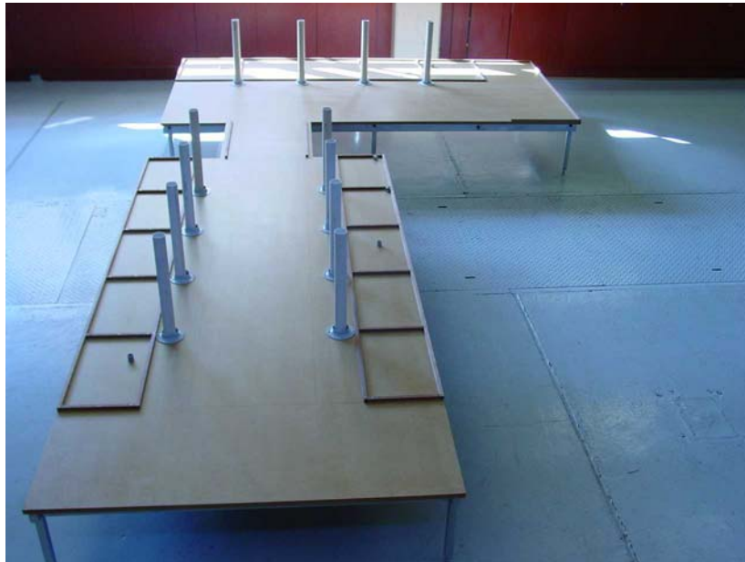
UNSW@ADFA Track (start area in fore ground)

The following photos are of the track fabricated for the UNSW@ADFA campus competition. This is likely to be the track used for the National Final. Note that the boards as supplied are slightly larger than the nominal 2400 x 1200 dimensions. They have not been cut down. The 12 x 12 DAR fences on the board extremities are flush with the edge of the as supplied boards. The implication is that the fields are slightly deeper. Rule 17 defines the finish area fences to be aligned with the board edges.