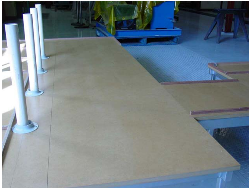
UNSW@ADFA Track (segment 2 with finish area in distance)