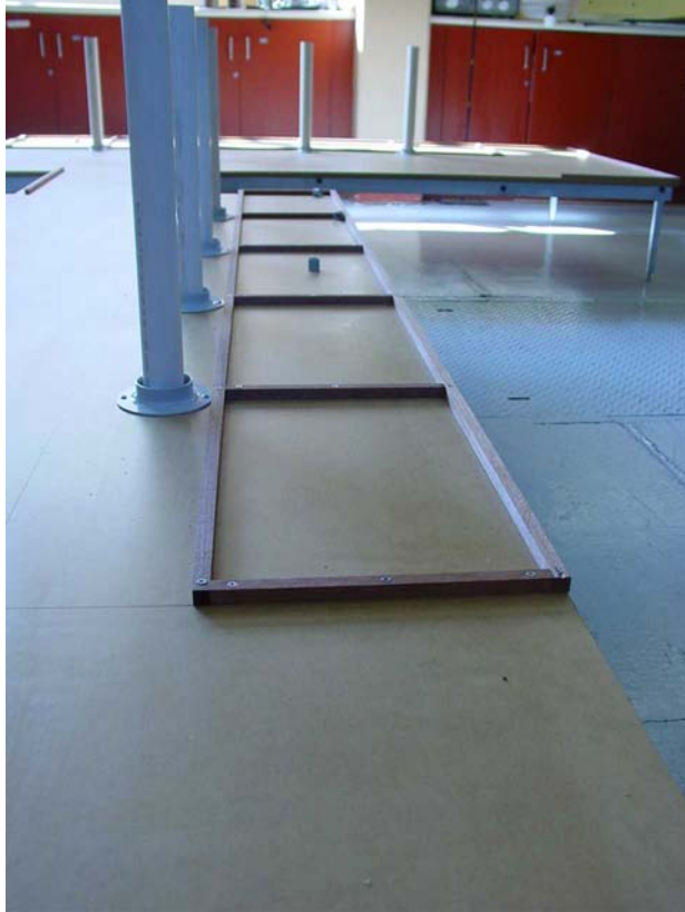
UNSW@ADFA Track (from extreme right hand corner of start area)