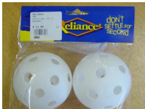
FIGURE 3 - RELIANCE PLASTIC PERFORATED WHIFFLE BASEBALLS

EXPLANATORY NOTE: A pack of 6 Reliance whiffle base balls was sourced in Canberra from Sportsman’s Warehouse at a cost of $11.99.