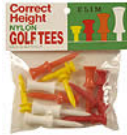
FIGURE 2 - ELIM NYLON GOLF TEES