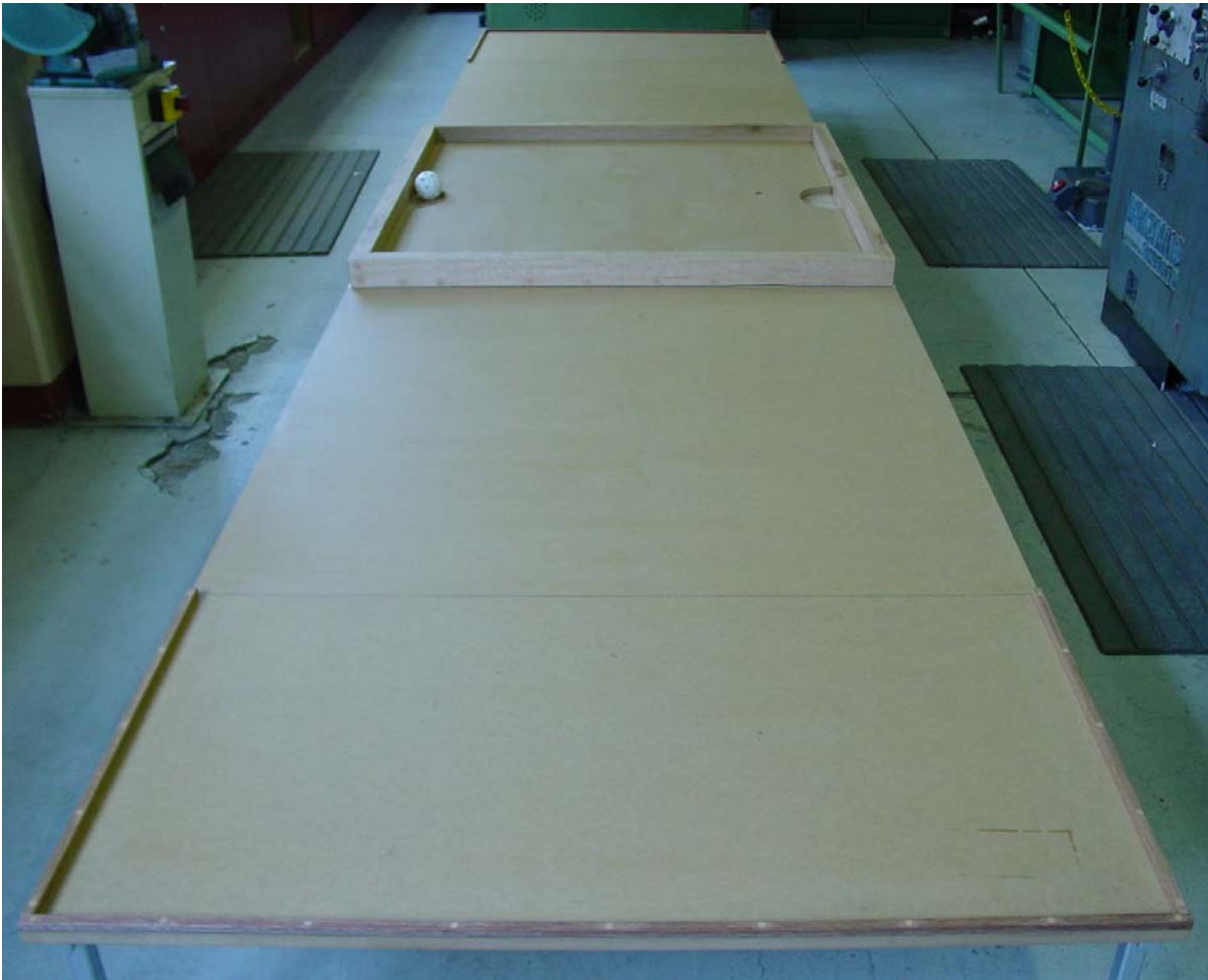
UNSW@ADFA Track (staging area in fore ground)

The following photos are of the track fabricated for the UNSW@ADFA campus competition. This is likely to be the track used for the National Final.