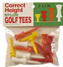
FIGURE 2 - ELIM NYLON GOLF TEES

11. Ten golf balls will be randomly positioned on ten tees leaving eight positions clear. The balls represent the passengers to be rescued. The height of support above the road offered by the tees will vary in the range of 15 to 45 mm. A minimum of three balls will be positioned in a given row.