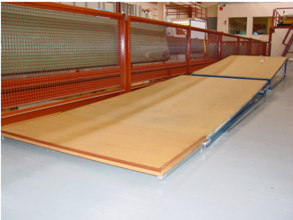
FIGURE FAQ 2 - UNSW@ADFA Track